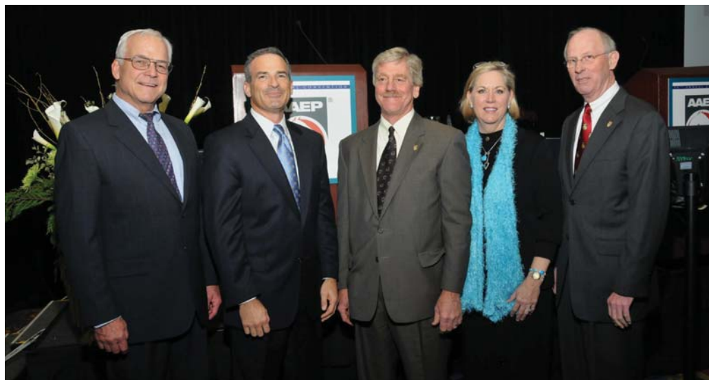
2009 AAEP Executive Committee