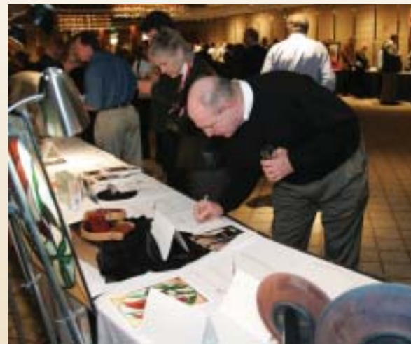
Banquet attendees had an impressive selection of items on which to bid during the Foundation Celebration silent auction.