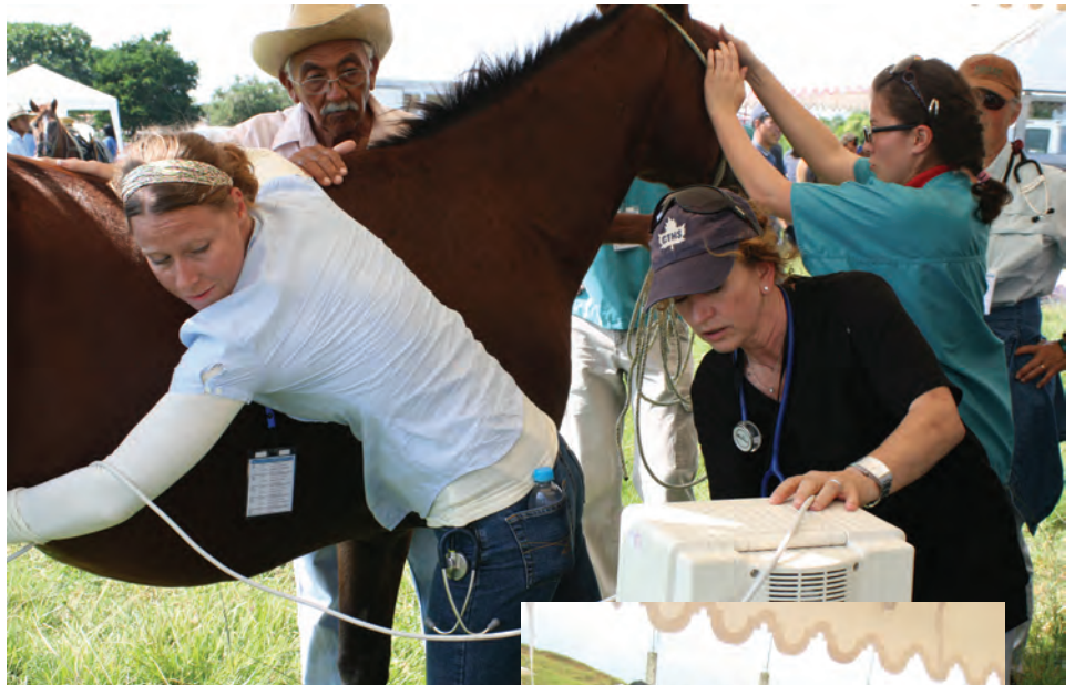
AAEP members volunteered services in four developing Mexican communities Oct. 17-22.