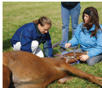
The AAEP Foundation provided financial support to establish Operation Gelding.

tions and events can undertake to create programs that help horses in need. Best Practices cites many examples of how organizations and groups can get involved, including gelding clinics. This handbook, along with other information about the UHC, can be found at www.unwantedhorsecoalition.org .