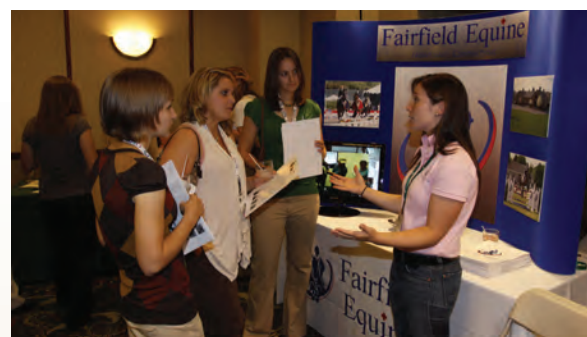
Veterinary students learn about careers in equine veterinary medicine at the 2010 Opportunities in Equine Practice Seminar, a program supported by the AAEP Foundation.

For a complete list of grant recipients and Foundation-supported programs, visit www.aaepfoundation.org .