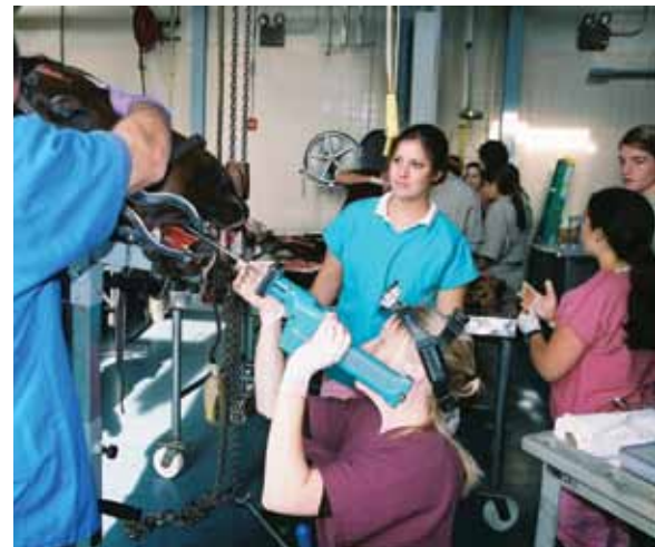
Students across the United States benefited from hands-on experience during dentistry, farriery and horse handling short courses.

"We are very pleased to once again offer funding to so many worthy pro-