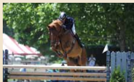
Tennessee Equine Hospital Grand Prix benefits the AAEP Foundation.

Thanks to Tennessee Equine Hospital and the Williamson County Chamber of Commerce for partnering to help the horse through this donation.