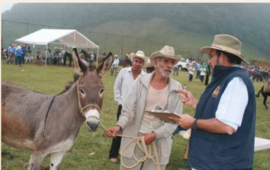
More than 1,000 equids in Mexico's developing communities were helped during the 2nd Annual Equitarian Workshop supported by the AAEP Foundation.

For the past 17 years the AAEP Foundation has allocated more than $2.2 million in grants to programs that promote the health of horses. Grant applications for 2012 will be available at www.aepfoundation.org in early February.