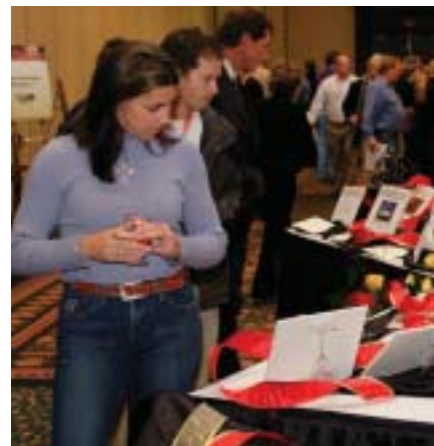
Guests enjoy browsing the many items that were on display at the 2006 Foundation Celebration.

Each year the silent and live auctions raise funds to support the AAEP Foundation, whose mission is to improve the health and welfare of the horse through support of research, education and benevolence and the equine community. Thank you to all contributors to the 2006 auction and we hope to see you in Orlando, Fla., on Dec. 4, 2007 for an all-new and exciting venue for the Celebration!